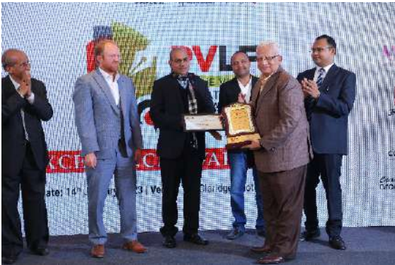
Publisher: Dreamland Publication Category: Children's Book Position: Second