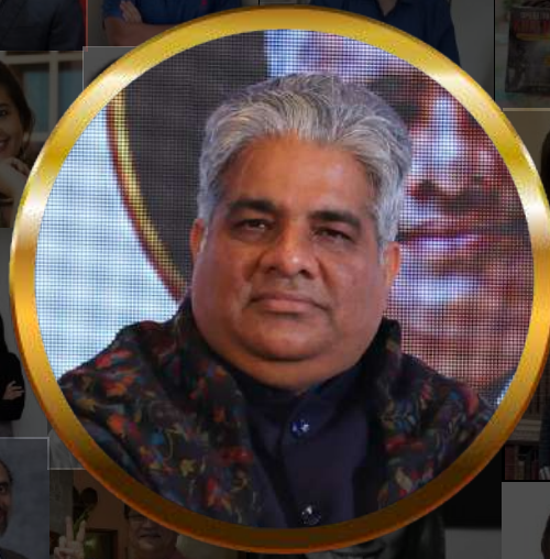
Shri Bhupender Yadav Minister for Environment, Forest & Climate Change; and Labour & Employment Govt. of India