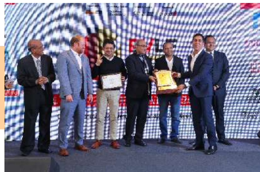
Publisher: FingerPrint Publishing Category: Trade Books Position: First