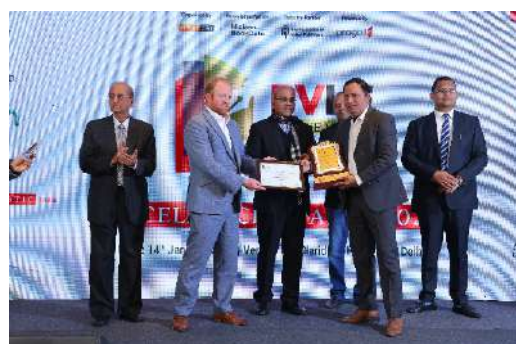
Publisher: Manjul Publishing House Pvt. Ltd. Category: Trade Books Position: Second