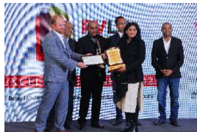
Author: Sadhguru Category: Most Celebrated Author of the Year