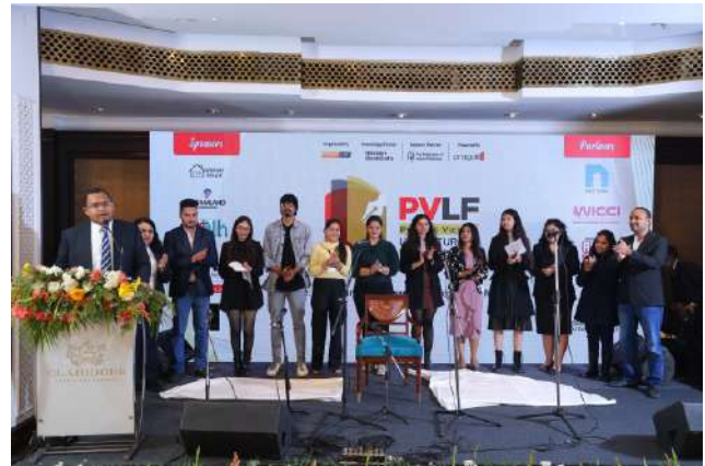
Frontlist Media & PVLFF 2023 Team