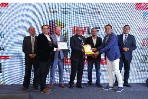
Publisher: Disha Publication Inc Category: Education Position: Second