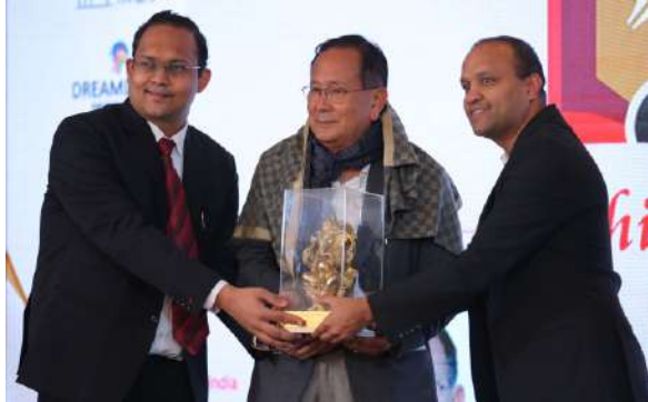
Felicitation of Chief Guest Dr RajKumar Ranjan Singh