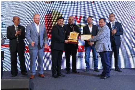
Publisher: Arihant Publications India Ltd Category: Education Position: First