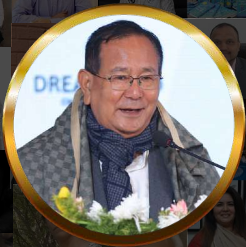
Dr Rajkumar Ranjan Singh Minister of State for External Affairs and Education, Govt. of India