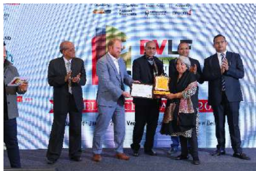
Publisher: Rajpal & Sons Category: Hindi Position: Second