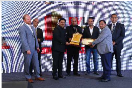
Publisher: Arihant Publications India Ltd Category: Test Prep Position: First