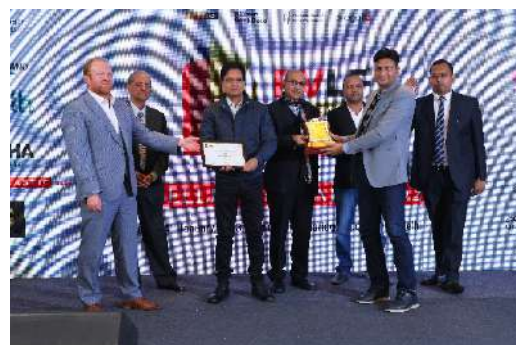
Publisher: Disha Publication Inc Category: Test Prep Position: Third