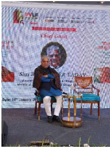
Chief Guest, Shri Bhupender Yadav, discussing his book 'The Rise of BJP'