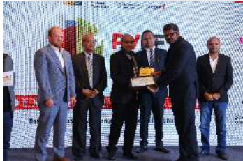
Author: J. Sai deepak Book: India, Bharat and Pakistan Publisher: Bloomsbury India Category: Best Non Fiction