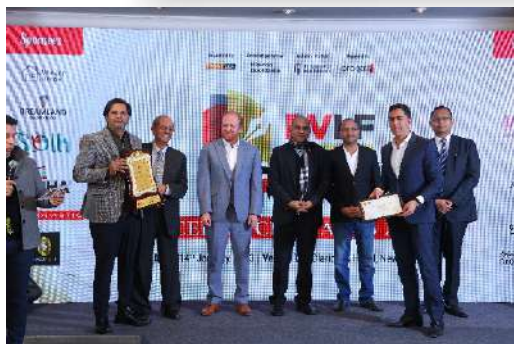
Publisher: Wonder House Books Category: Children's Book Position: First