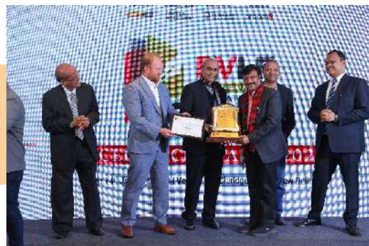
Publisher: Prabhat Prakashan Category: Hindi Position: First